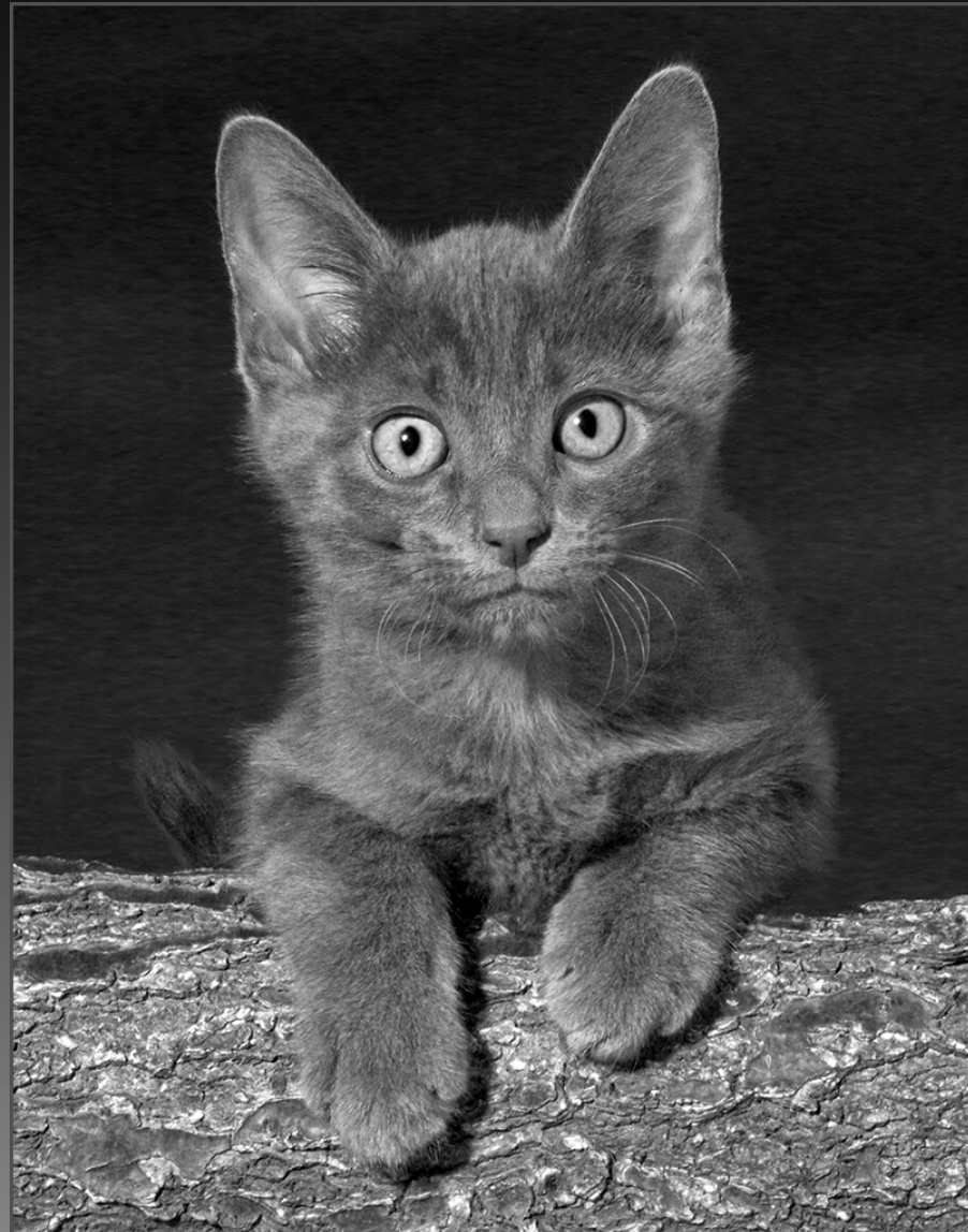
'KITTEN ON BLUE MONO' BY DALE GILKINSON (Silver Medal)