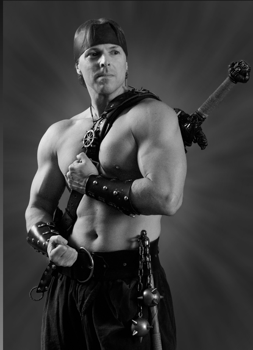
'WARRIOR ON ALERT' BY DIANE RACEY (Bronze Medal)